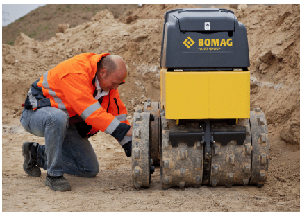
Flexible working widths Original BOMAG drum extensions