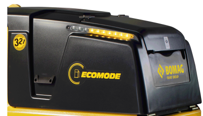
Higher quality, lower costs ECONOMIZER - The compaction display (optional)