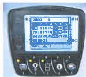
Operation History Record