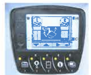
Max. Oil Flow Setting